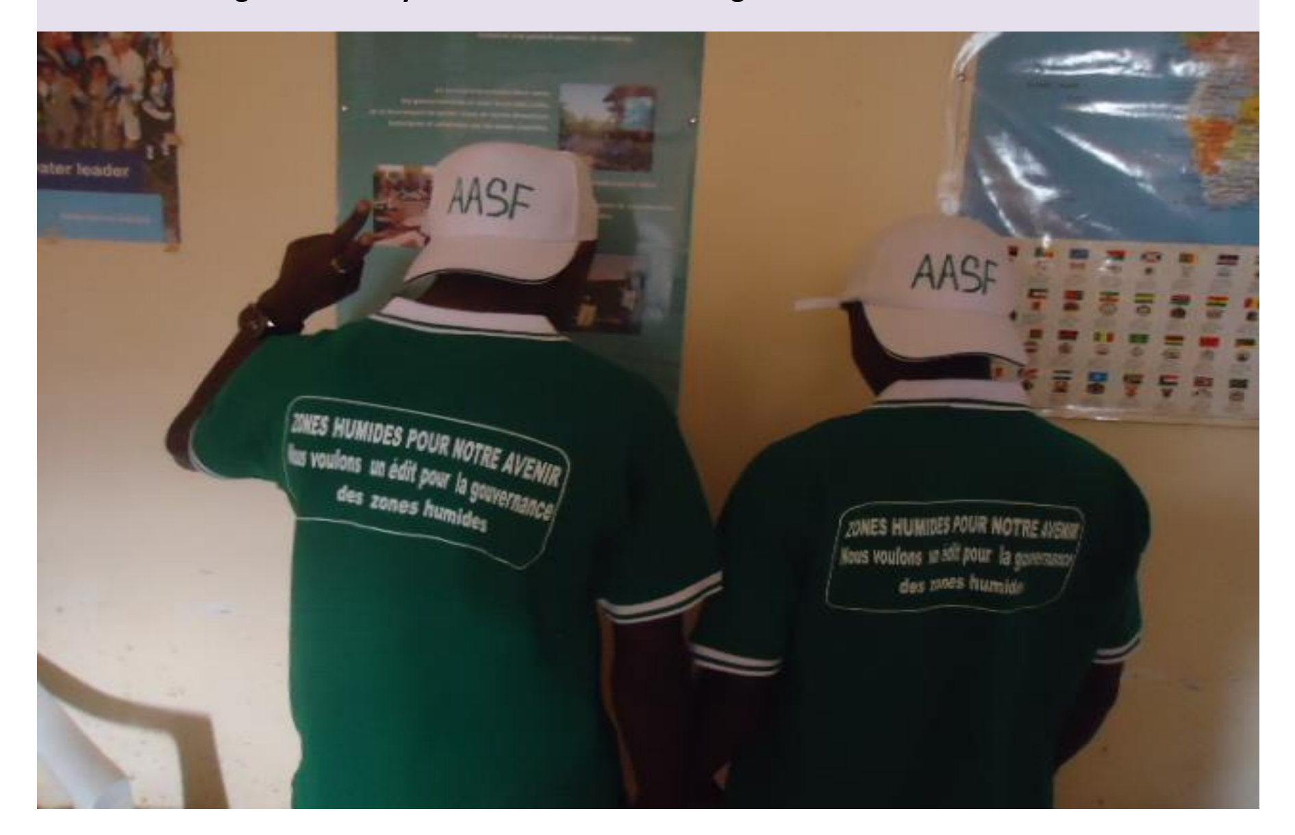
The message of advocacy: we want an edict for the governance of wetlands in South Kivu